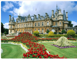
Just one of a multitude of Rothschild Palaces

Definition of Judaism: Jews collectively who practice a religion based on the Torah and the Talmud.