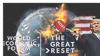
The Establishment's Plan to Divide Part 2: COVID-19, Election 2020, and The Great Reset September 29, 2020

We know this is happening in COVID-19 because people who have died of the disease have noticeable ferroptosis signatures in their tissues, as well as various other oxidative stress markers such as nitrotyrosine, 4-HNE, and malondialdehyde.