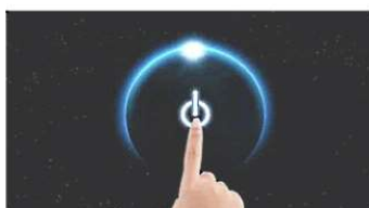
COVID19, The Great Reset & The New Normal July 31, 2020 In "Business"