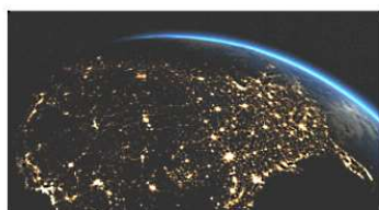
Why Are 'Conspiracy Theorists' Worried About an Impending Power Grid Failure? July 1, 2021

This condition is not unknown to medical science. The actual name for all of this is acute sepsis.